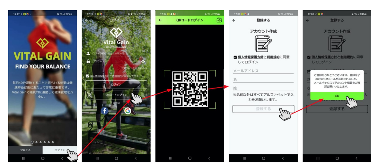
STEP 1: Users scan the QR code issued by the program owner, which is organized by the local government or corporate health insurance group, to register. An activation link will be sent via email.

The acquisition of this patent addresses the issue that arose due to the variability in data entry by users when starting the app, which affected the accuracy of the data, leading to lower precision of the statistical data. However, by allowing users to authenticate themselves with their My Number Card or driver's license through the app, it becomes possible to collect accurate profile information and, consequently, obtain precise statistical data. As a result, it has become possible to encourage behavior modification more effectively. Furthermore, utilizing this patent, we have developed a "Statistical Indicator Display Function for Behavior Modification."