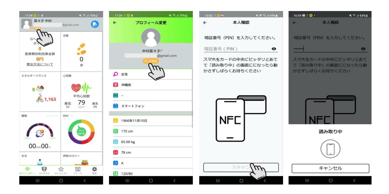
STEP 2: Log in to the app again and register for identity verification using your My Number card, driver's license, residence card, etc.